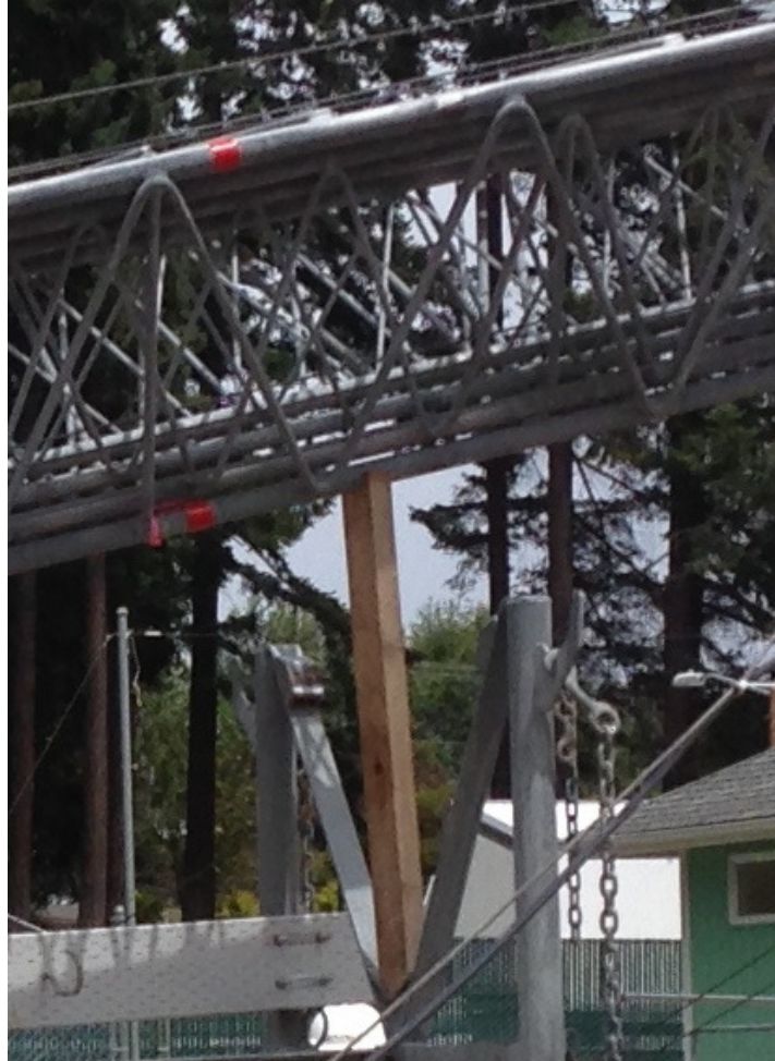
Figure 2: 2x4 Safety support