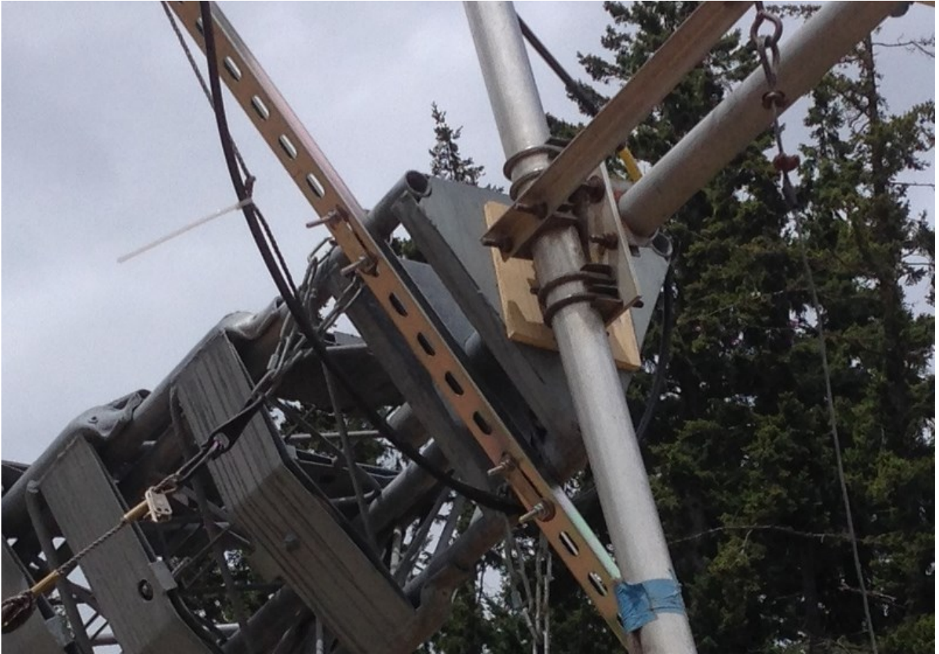
Figure 3: Detail of mast mount