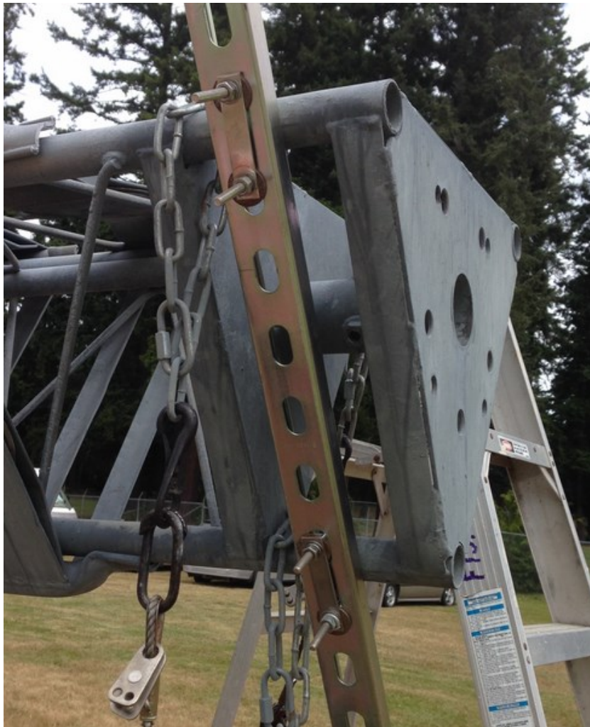
Figure 1: Crosspiece attachment orientation.

The weight loading rating of the top of the tower per the manufacturer's manual is 250 pounds. This should be more than sufficient to support any reasonable antenna and hardware arrangement. The messenger line(s) should be long enough to touch the ground when the tower is at full height, and of sufficient strength to readily support the weight of the cabling. Be sure to secure the cabling to the messenger line with Cable ties every six feet or so.